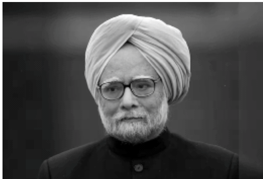
Manmohan Singh (1932-2024)

Chautala is the son of Chaudhary Devi Lal, who served as the 6th Deputy Prime Minister of India. Devi Lal was also a Chief Minister of Haryana