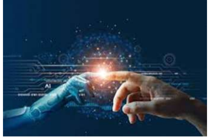
Developments in Artificial Intelligence(AI) Continue to Astound—and Concern