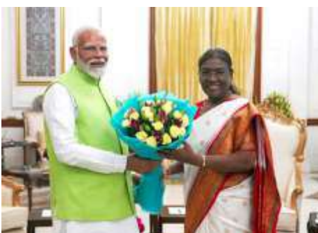
President Droupadi Murmu dissolves the 17th Lok Sabha.