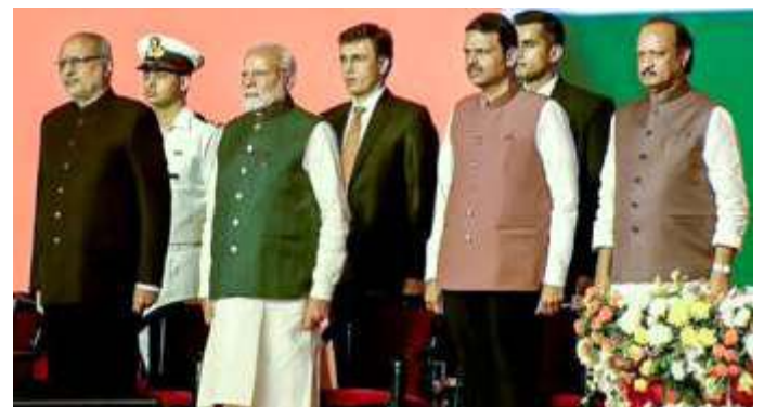
Devendra Fadnavis took the oath as the new Chief Minister of Maharashtra. Along with him, Eknath Shinde and Ajit Pawar also took their oaths as Deputy Chief Ministers in the same ceremony.