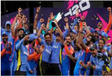
India beat South Africa and wins the 2024 ICC Men's T20 World Cup.