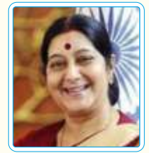
Padma Vibhushan L. Smt. Sushma Swaraj