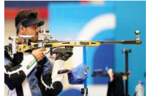
Swapnil Kusale wins a bronze medal in Men's 50 meter rifle three positions at the 2024 Summer Olympics in Paris.