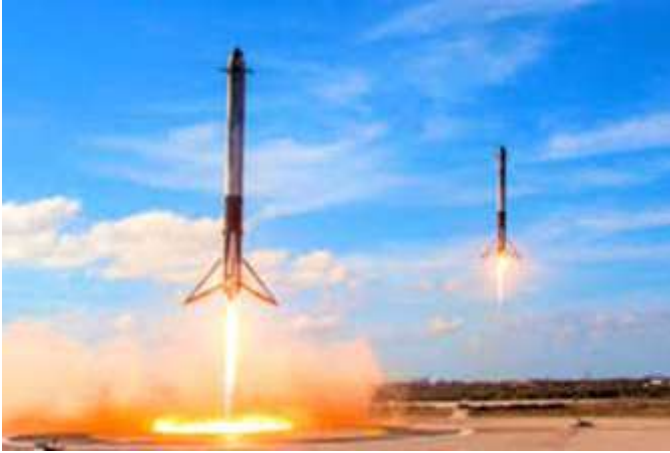
Race Is Alive and Well - The Space Japan landed a SLIM (Smart Lander for Investigating the Moon) on a lunar crater in January and transmitted data back to earth for three months.