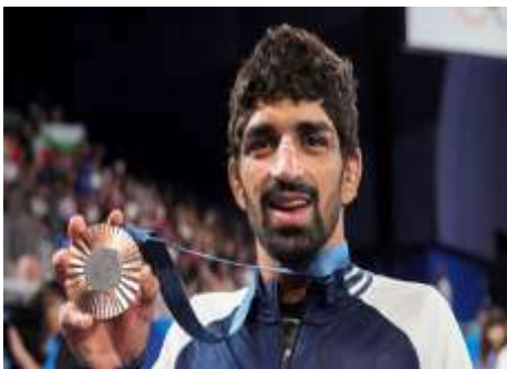
Aman Sehrawat wins a bronze medal in Men's freestyle 57 kilograms at the 2024 Summer Olympics in Paris.