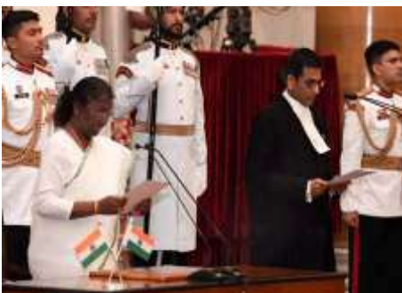
Dhananjaya Yeshwant Chandrachud (born 11 November 1959) is an Indian jurist, who served as the 50th Chief Justice of India from 9 November 2022 to 10 November 2024.