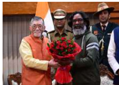
The Jharkhand Mukti Morcha-led alliance wins a majority in the Jharkhand Legislative Assembly.