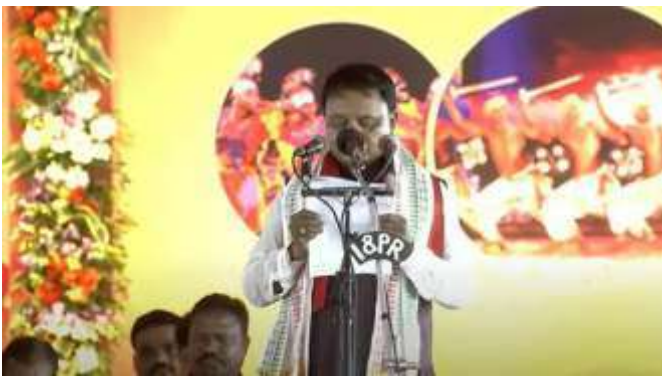
Mohan Charan Majhi becomes BJP's first chief minister in the state, succeeding BJD's Naveen Patnaik