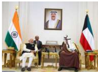
Visit of Prime Minister to Kuwait (December 21-22, 2024)