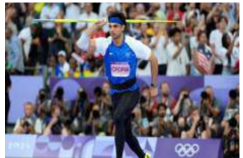
Neeraj Chopra wins a silver medal in Javelin throw at the 2024 Summer Olympics in Paris.