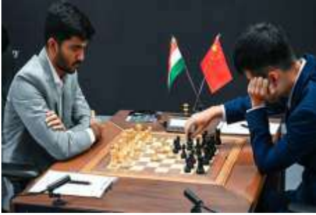
Eighteen-year old Gukesh Dommaraju of Chennai becomes the youngest person to win the World Chess Championship.