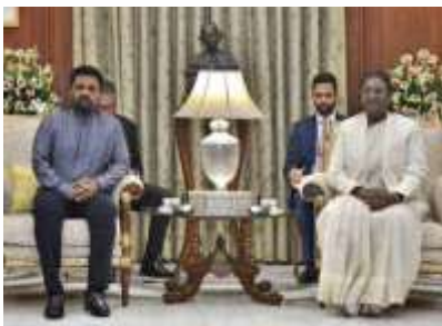
Visit of President of Sri Lanka to India (December 15-17, 2024)