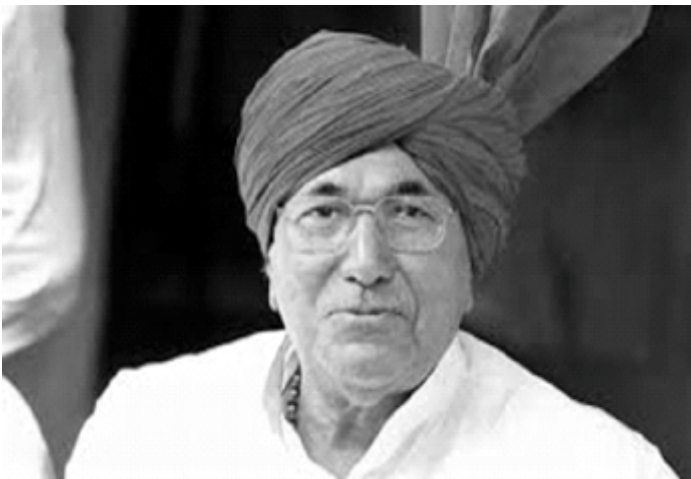
Former Haryana Chief Minister Om Prakash Chautala dies at 89