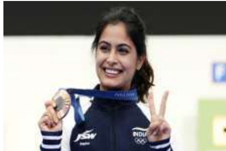
Manu Bhaker wins a bronze medal in 10 metre air pistol at the 2024 Summer Olympics in Paris.