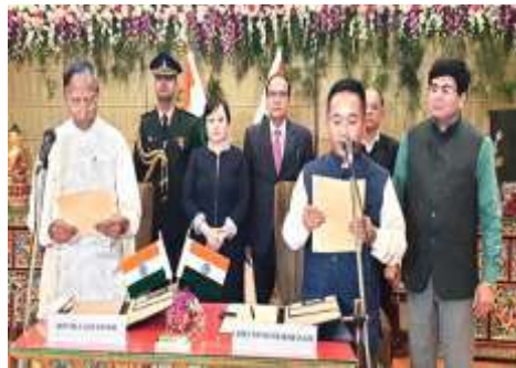
Prem Singh Tamang (Golay) takes oath as Sikkim Chief Minister for second consecutive term