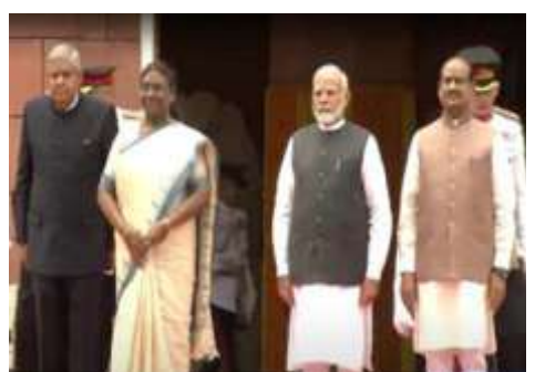
President Droupadi Murmu inaugurates the 18th Lok Sabha.