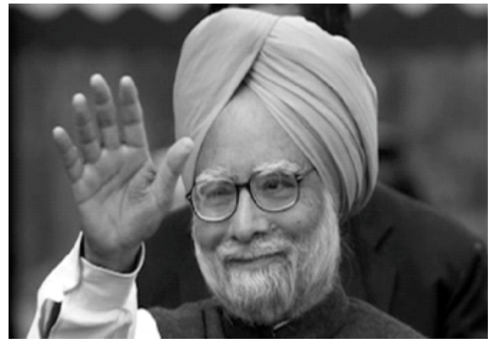
Manmohan Singh, 92, politician and former Prime Minister of India passes away