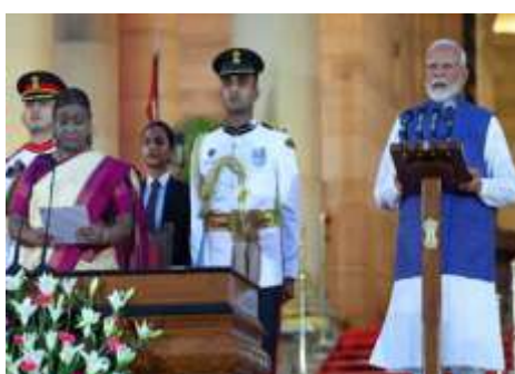
Narendra Modi is sworn in for his third term as Prime Minister of India