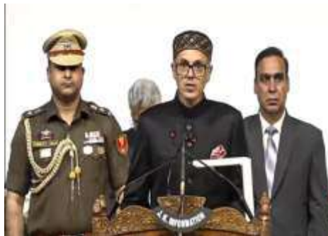
An alliance between the Congress party and the Jammu & Kashmir National Conference wins 48 of 90 seats in the state elections.