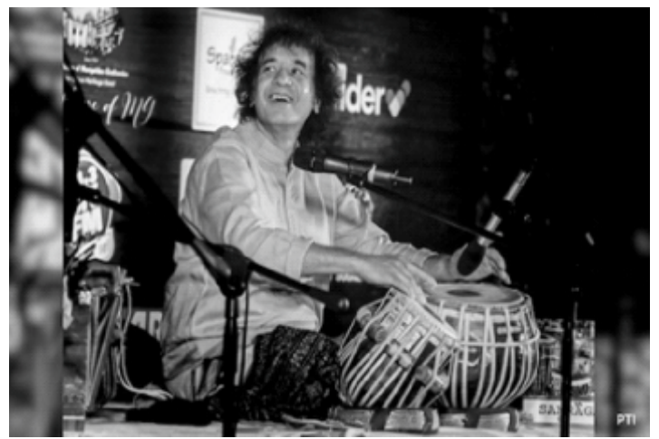
Tabla maestro Zakir Hussain passes away at 73, fused music to make magic