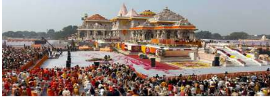
Ram Mandir Prana Pratishtha : The Ram Mandir at Ayodhya in Uttar Pradesh is inaugurated by Prime Minister Modi.