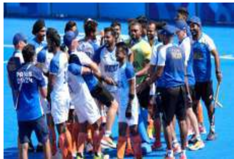
The India men's national field hockey team wins a bronze medal at the 2024 Summer Olympics in Paris.