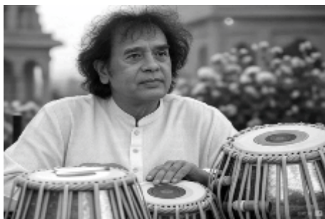
Zakir Hussain (1951-2024)

The world of music mourns the loss of tabla maestro Zakir Hussain, who passed away unexpectedly, leaving fans and fellow musicians in deep shock. A true icon in Indian classical music, Hussain's rhythms transcended borders, earning him global acclaim. From collaborations with legends like Ravi Shankar to his innovations in fusion music, Hussain's legacy remains unparalleled. At the age of 72, Zakir Hussain died due to a debilitating respiratory condition; idiopathic pulmonary fibrosis (IPF), which had been affecting his health in recent years.