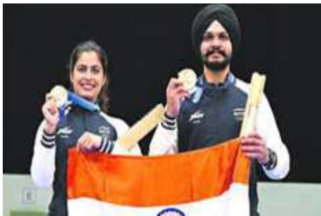
Manu Bhaker and Sarabjot Singh win bronze medals in Mixed 10 metre air pistol team at the 2024 Summer Olympics in Paris.