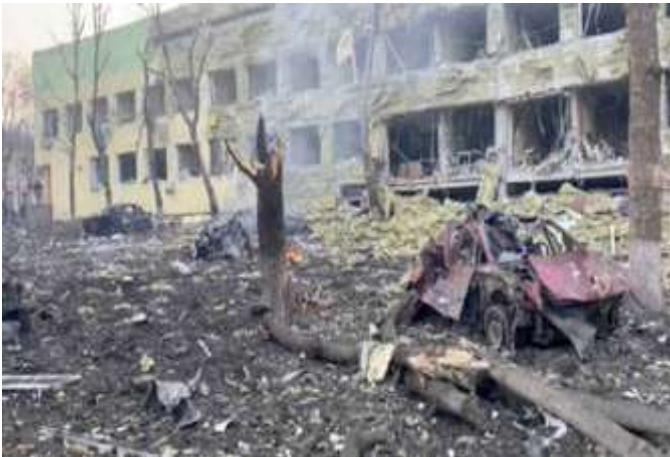
Russia Takes the Offensive in Ukraine