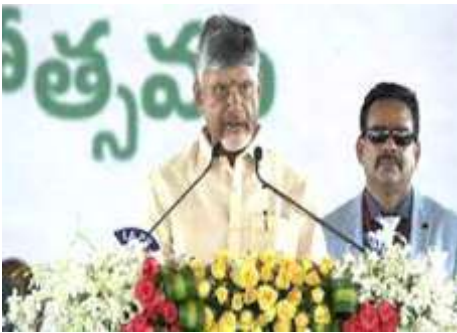
N Chandrababu Naidu, who led the Telugu Desam Party-Bharatiya Janata Party-Janaseena alliance to a massive win in the Andhra Pradesh assembly elections, took oath as the chief minister of the southern state