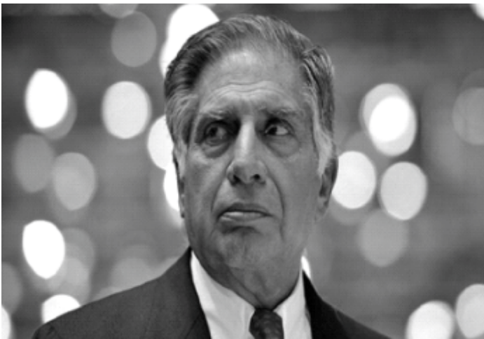
Ratan Tata, 86, conglomerate industry executive, chairman of Tata Sons and Tata Group (1990–2012, 2016–2017) passes away