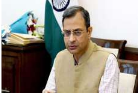
The Governor of the Reserve Bank of India Sh. Sanjay Malhotra Takes Charge as RBI Governor