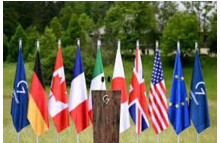
Incumbents facing the voters in 2025 must be uneasy. Two thousand twenty-four began as the mother of all election years.