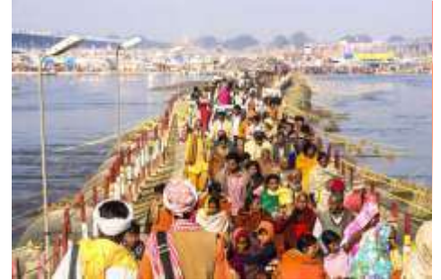
The Maha Kumbh Mela 2025 will take place from January 13, 2025 (Paush Purnima) to February 26, 2025 (Maha Shivratri)