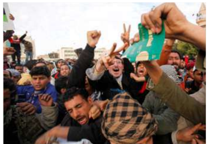
Upheaval in the Middle East-The events unleashed by Hamas's October 2023 attack on Israel reverberated across the Middle East in 2024. Israel continued its war in Gaza.