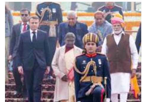
India's 75th Republic Day is celebrated with French President Macron participating as the Chief Guest.