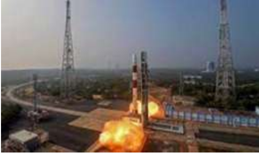
ISRO successfully launches its first X-Ray polarimeter satellite XPoSat to study the polarization of intense X-Ray sources in space.