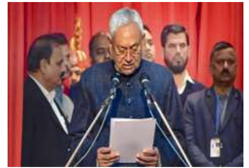
Chief Minister of Bihar Nitish Kumar resigns, ending the coalition with the INDIA bloc and takes oath as the CM for the ninth time by joining the Bharatiya Janata Party (BJP)-led NDA.