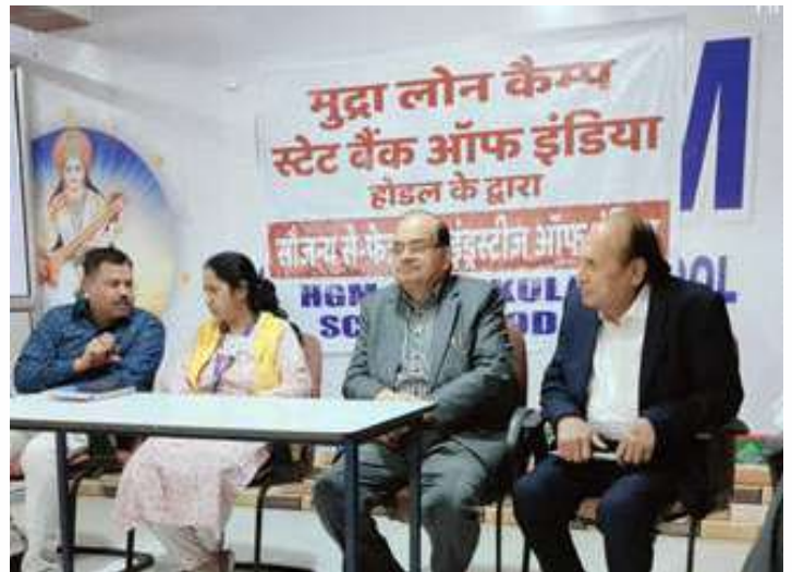
FII and State Bank of India, Hodal organizes Mudra loan camp