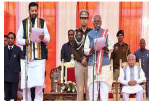
Haryana Legislative Assembly election: The BJP retains control of the state Legislative Assembly for a record third term, winning 48 of 90 seats.