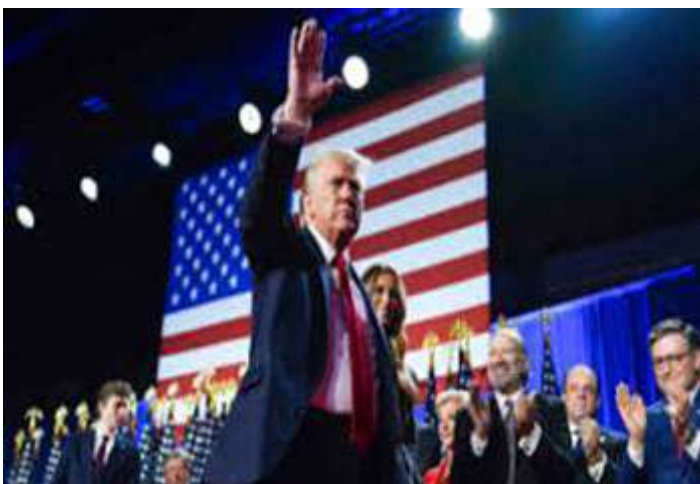
Donald Trump Wins the U.S. Presidential Election