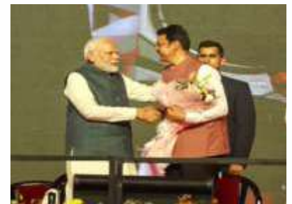
PM congratulates Shri Devendra Fadnavis on taking oath as Maharashtra's Chief Minister